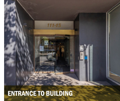
ENTRANCE TO BUILDING